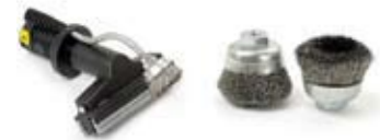
Gum Removal Parts