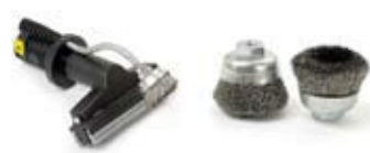
Gum Removal Parts